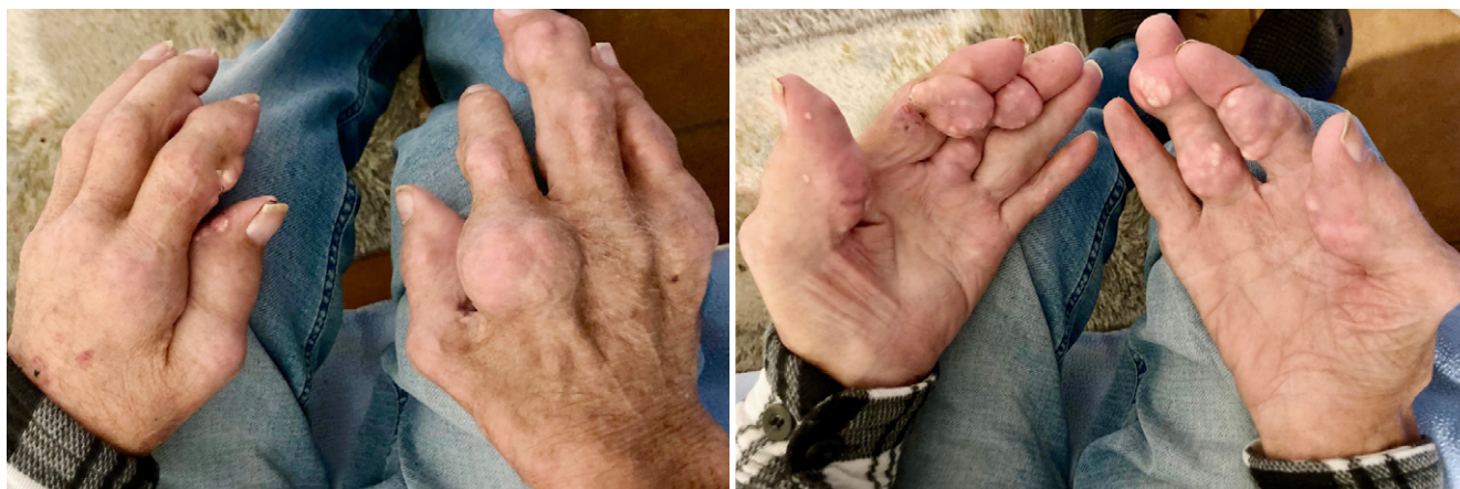
FIGURE 1. Marked joint deformity and multiple bilateral gouty tophi in both hands.