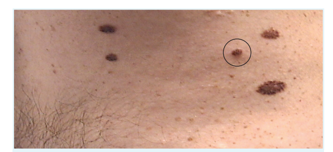
FIGURE 1. Oval brown papule located on the lower right back (inside the black circle).