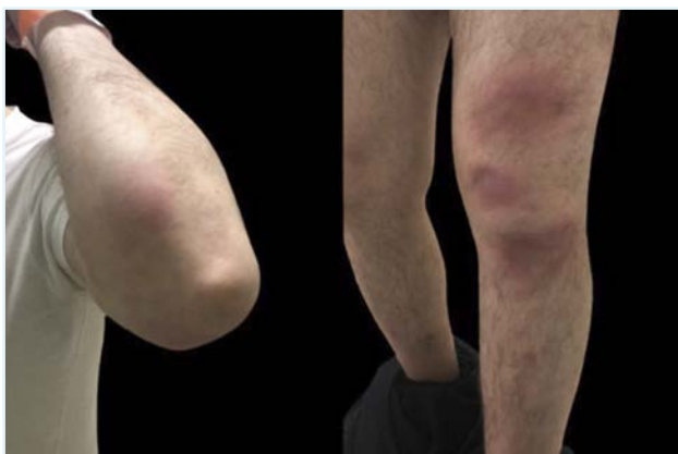
FIGURE 1. Multiple lesions suggestive of erythema nodosum in both upper (left) and lower limbs (right).