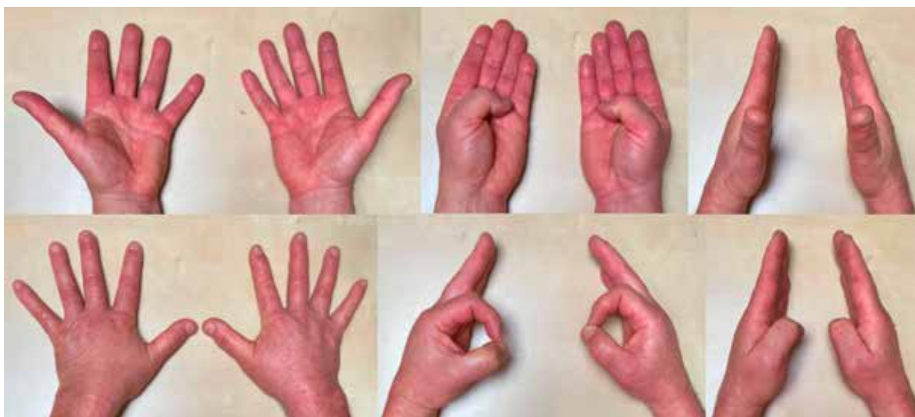
FIGURE 3. Follow-up at 2 months, following conservative treatment with short-arm thumb spica for six weeks: range of motion of both hands.